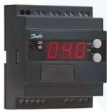
EKC 315 331 347 361 366 PRESSURE TRANSMITTERS