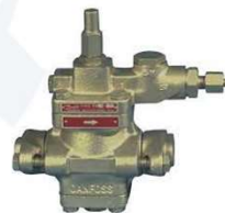
MODULATING LIQUID LEVEL REGULATORS