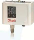
KP PRESSURE SWITCHES