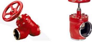
STOP VALVES SVA