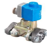
FAFILTER WITH FLANGE